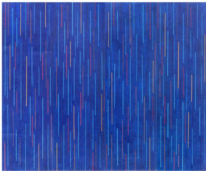
City Lights 2015 oil and acrylic on canvas 267 x 320 cm (4 panels)

© Made Wianta, Courtesy of Mizuma Gallery