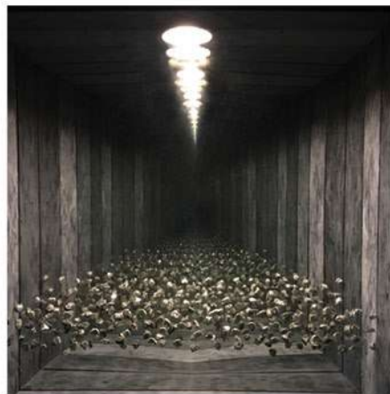
Stretch (details) 2017, reflective media, LEDs, objects, 48.9 x 48.9 x 17.8 cm