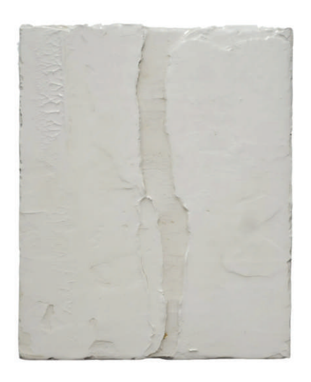
"Divergent" (2017) by Ben Loong Resinated drywall plaster and gold leaf on wood / 36cm x 29cm x 3cm / 14.2" x 11.4" x 1.2" Available on theartling.com!

The unique textures reflect the artist's own fascination with geography, drawing inspiration from the natural world. His "Terra Blanca" series is interesting in its use of a monchromatic colour palette; moving a round the piece the uneven surface casts shadows that constantly move and change based on one's position in relation to the work. In a way, it is very much reflective of our own multi-faceted and diverse lived experiences and the ever-changing world we live in.