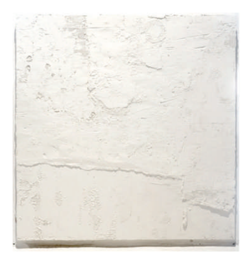
"Covergent" by Ben Loong Image courtesy of the artist

Loong's most recent body of work is his series "Terra Blanca", in which he coats a board in a thick layer of plain white drywall plaster, creating undulating peaks and troughs and unexpected textures - effectively 'painting' with his chosen material. Despite being a humble material, Loong elevates it into the realm of art, using it ceate negative and positive spaces.