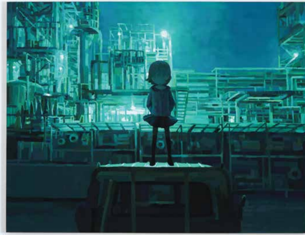
▲ Blowin' in the wind 2017 acrylic on canvas 112 x 145.5 cm