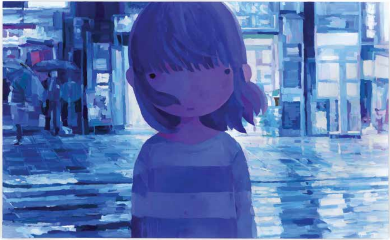
▲ sayonara wo nokoshite 2018 acrylic on canvas 89.4 x 145.5 cm