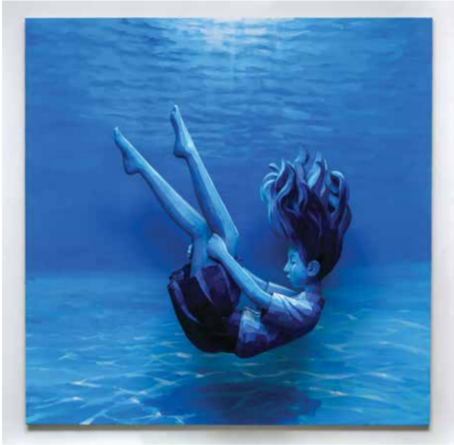
▲ In the sea 2018 mixed media 130 x 130 x 65 cm