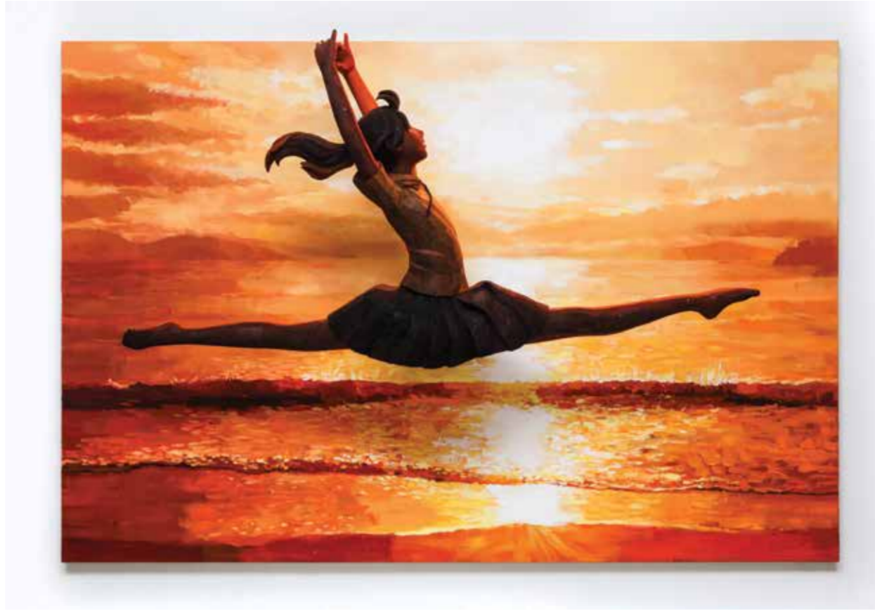
▲ Flightless wings 2017 mixed media 130.3 x 194 x 60 cm