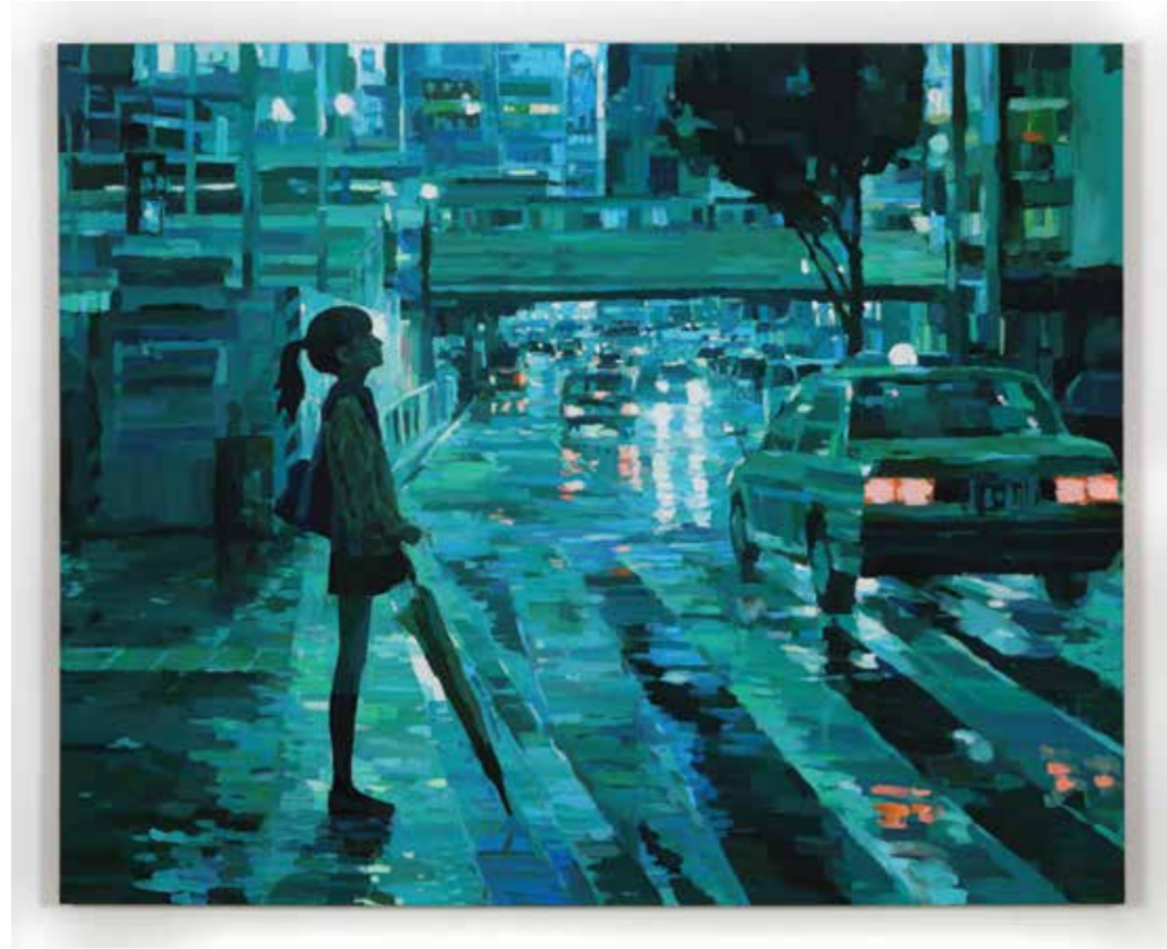
▲ A rainy day - 1 2018 acrylic on canvas 130.3 x 162 cm