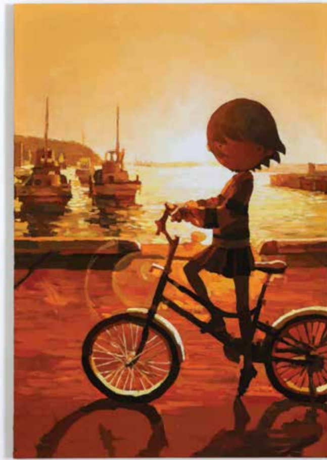
◀ On a sunny day 2017 acrylic on canvas 72.7 x 50 cm