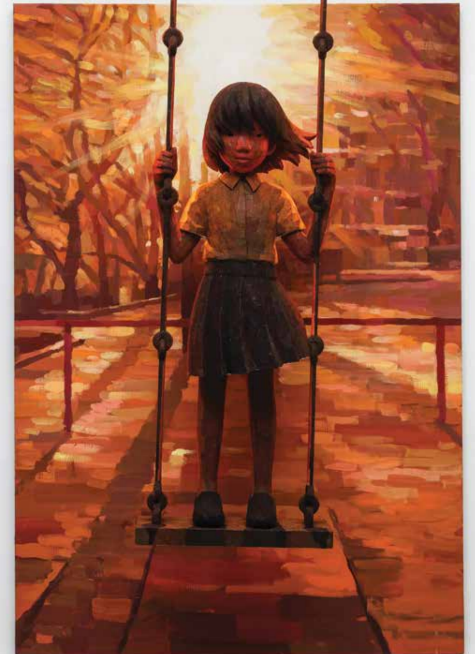
▼ Swing against the sunset 2018 acrylic on canvas 130.3 x 89.4 x 40 cm