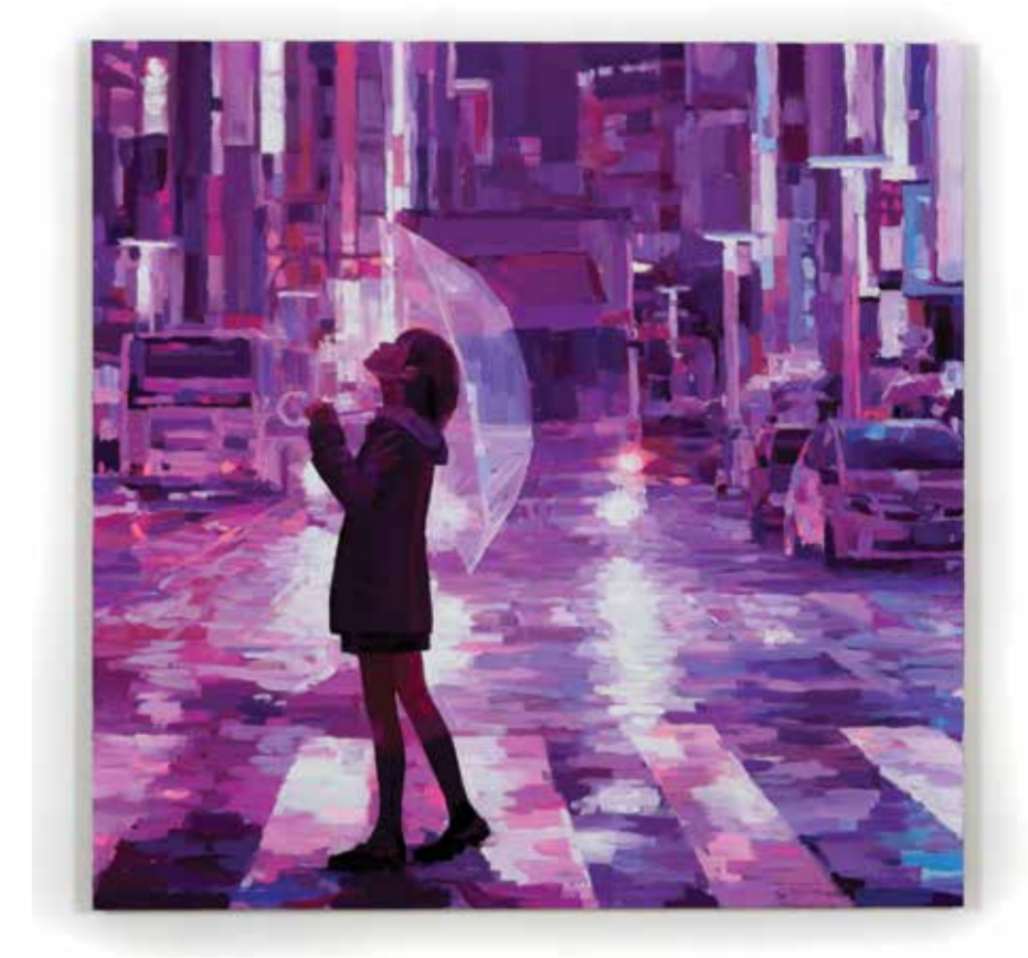
▲ A rainy day - 2 2018 acrylic on canvas 130.3 x 130.3 cm