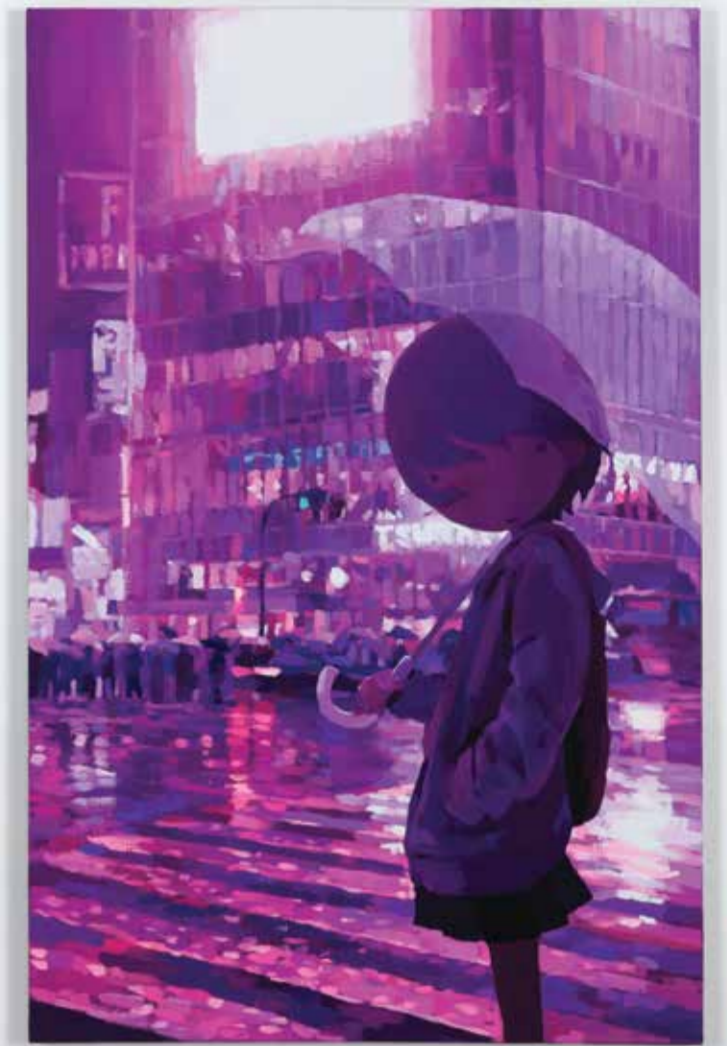
▲ A light 2017 acrylic on canvas 100 x 65.2 cm