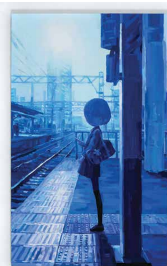
◀ quiet morning 2017 acrylic on canvas 130.3 x 80.3 cm