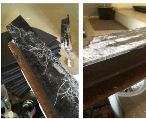
Detail shots of After Monument: Aquifer of Time

Earlier, when I mentioned about the redness on the surface of the rock that was caused by iron, here it also corresponds to the iron content on the surface of the H-beam. So I purchased this from a second-hand metal