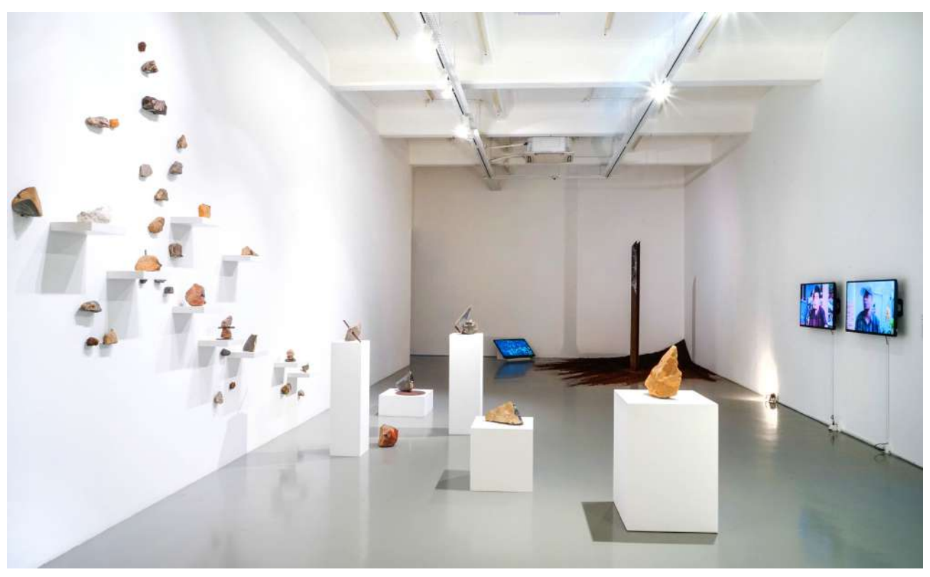
{\bf Exhibition\ View\ of\ Mountain\ Pass:\ Negotiating\ Ambivalence,\ Mizuma\ Gallery,\ Singapore}

Mountain Pass: Negotiating Ambivalence Solo exhibition by Zen Teh, curated by Hera Mizuma Gallery, 13 July 2019, 4pm-5pm