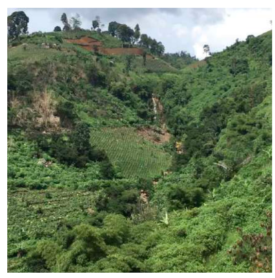
Site Research: Waterfall in Bandung

I also made it a point to engage with locals, so with Made's help I was able to conduct some interviews with the residents of North and South Bandung, which are shown side by side on two screens. We also found the largest construction site in the whole vicinity, and from the