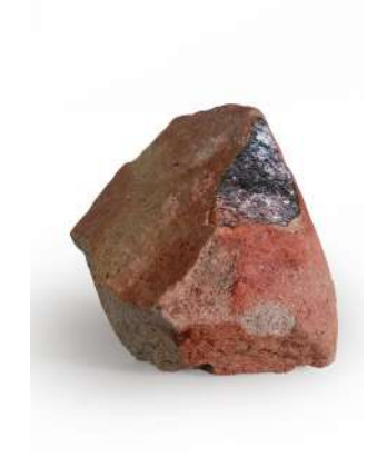
Zen Teh, After Monument: Imprinting geological Traces 1, 2019, photographic imprint on found rock, 16 x 17.5 x 14 cm, © Zen Teh

Zen: I wanted to find out from Rinaldi how can we understand what was here before the construction. We assessed the site together as we picked up some rocks and tried to study what they are. You will see at the back of the gallery a documentation section of some rocks that we picked up and analyzed. The four types of rocks that we picked up are also presented as part of the installation.