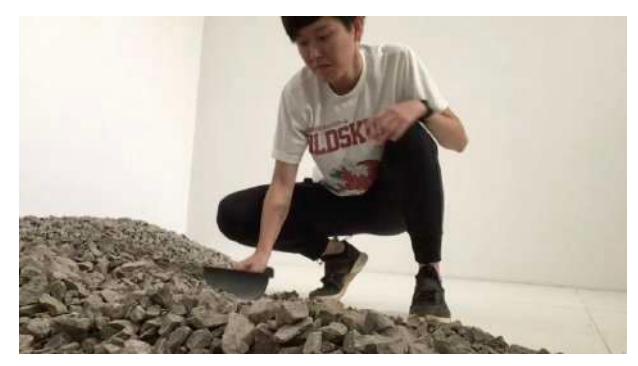
Video screenshot of the process of sculpting After Monument: Microcosm

Another is in the form of a long scroll that is 2.7 meters in length. The image on the scroll is a composite of images of mountains at Kawah Putih, which is in the vicinity of Lembang. I also found the huge rocks in the construction site that I imagine as mountains. Juxtaposing two different sizes of these rocks in the