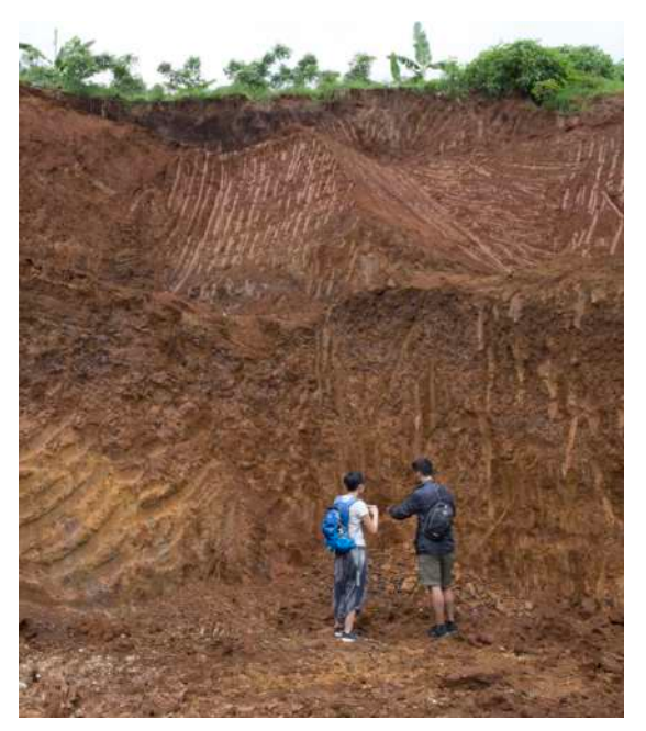
Site Research: Zen Teh (Artist) with Rinaldi Ikhram (Geologist) at the Dago Pakar Resor construction site

From the analysis and the site visits, we found that raw coal was present (pictured). You can also see them in the wall installation of the exhibition, they are the smaller rocks, with a darker shade of brown and are very brittle. They are the coals that are used for fossil fuel burning, but these ones here are thousands of years too early to actually be used. Even though they are about a thousand years old, they are still considered to be at a very early stage.