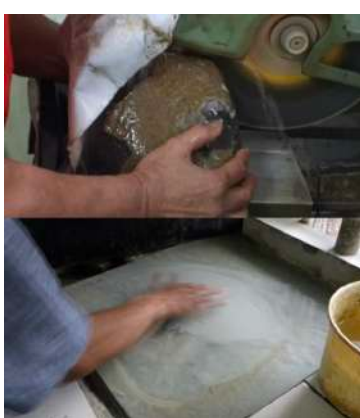
Research: Getting rock samples at the geological

It was in the museum that we could look at the beginning of a geological survey of Indonesia, as there were previously no other documentation of the mountains. However, this is not