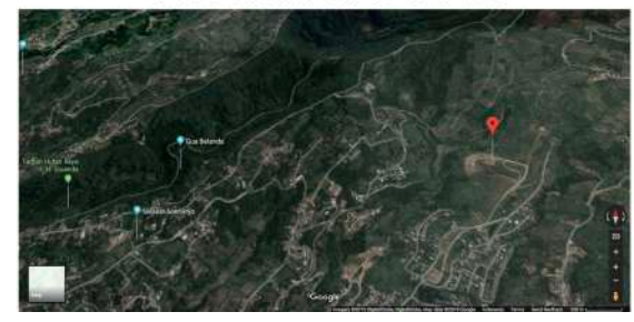
Map of North of Bandung