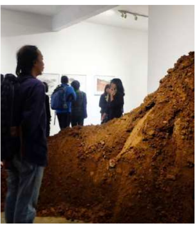
Top to bottom: Detail shots of After Monument: Mountain Pass, Opening of Mountain Pass: Negotiating Ambivalence at Selasar Sunaryo Art Space, Bandung, Indonesia