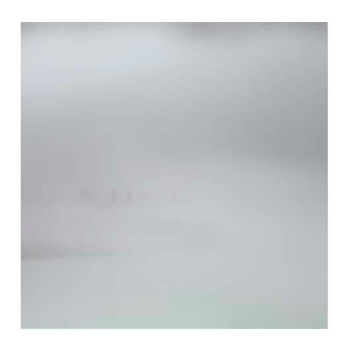
Detail shot of After Monument: Microcosm

Here is a close up of the scroll. (picture)