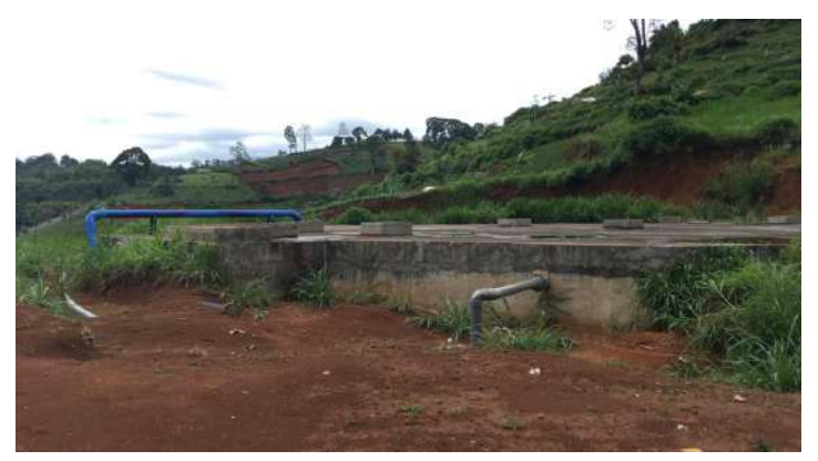
Site Research: Dago Pakar Resor construction site

conversations we know that this is located at the North of Bandung. The North is actually the green belt of Bandung due to their very lush volcanic soil which acts as the main rain absorbency area. Being on higher grounds, it helps prevent flooding in the lower grounds. From this investigation, we realised that the developments in this area had contributed to the severe flooding in South Bandung.