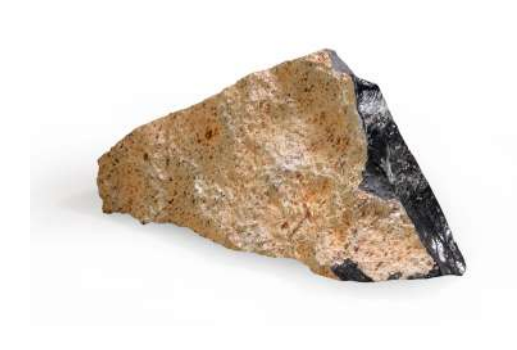
Zen Teh, After Monument: Imprinting Geological Traces 3, 2019

The result of understanding what this place used to be before, in the context of time, is shown as images imprinted onto those found outcrops. The work After Monument: Imprinting Geological Traces 3 (picture) is an andesite rock, and on the surface of it are images of a marsh I found in Lembang, an area in the same vicinity as the investigated site. On the imprinted image, I wanted to depict what this site could have been in the past. For me, the interesting juxtaposition here is the image of the marsh in Lembang and the found stone – the marsh that used to exist in this site, whereas the stone, containing at least a thousand years of history, was picked up from the ground due to human intervention of digging into the land. So there are many moments in which this sense of time intersects within the work itself.