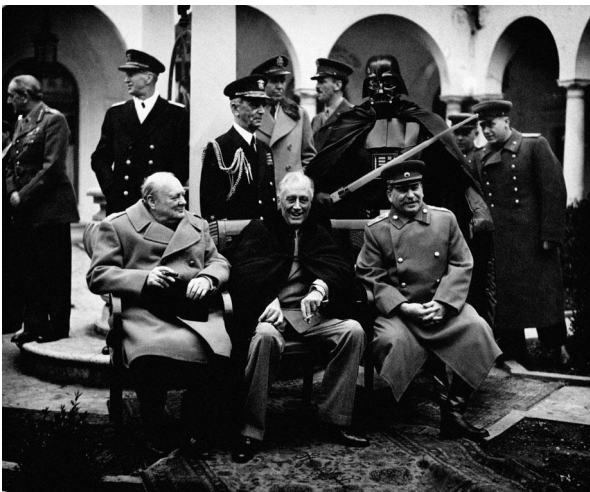
Yalta Conference, 1945. Agan Harahap.

Though Harahap's "Superhistory" isn't anything close to the truth, the project itself does evoke some actual falsification practices that existed long before Photoshop. Under Stalin's Communist regime, those deemed "enemies of the people," like Leon Trotsky, were not only killed but also erased from official photographs, as if they'd never existed. Harahap's work is a reminder of how easily the public can be manipulated. In its own way, his series pays homage to real facts and, indeed, to history.