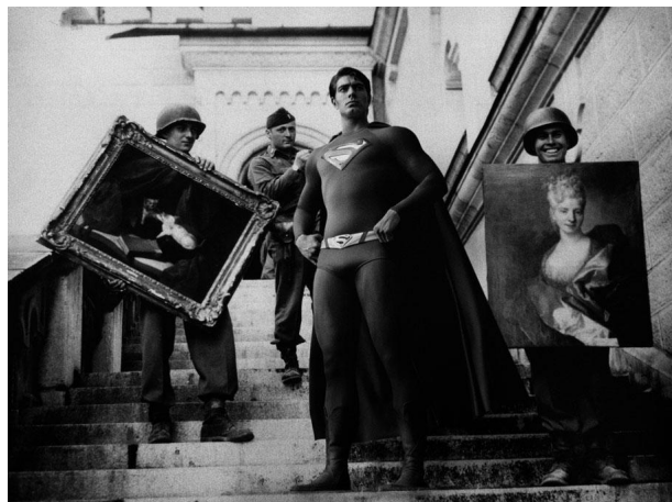
Neuschwanstein, 1945. Agan Harahap.

Harahap’s Photoshopped “Superhistory” presents the past as if it were a comic book, seamlessly integrating pop culture icons into the photographs that build our collective memory.