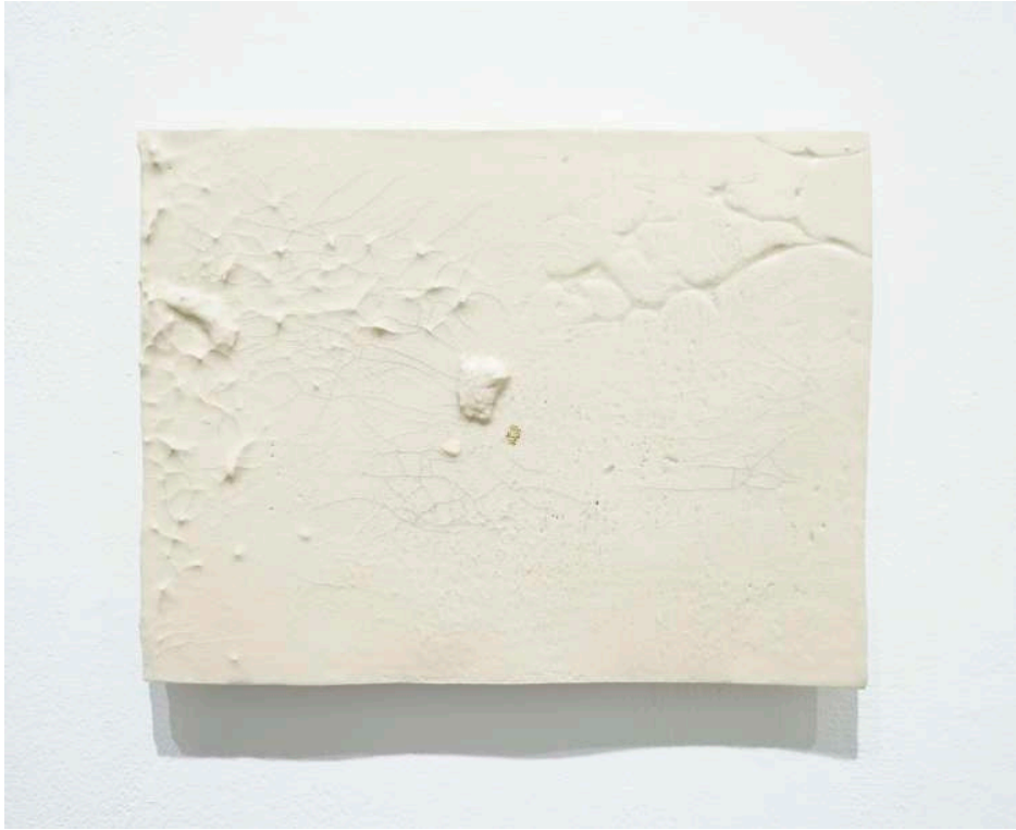
Ben Loong, Tablet 4 , 2021, glazed stoneware, gold leaf, Chinese ink, 20 × 26.5 × 3 cm © Ben Loong, images courtesy of the artist and Mizuma Gallery