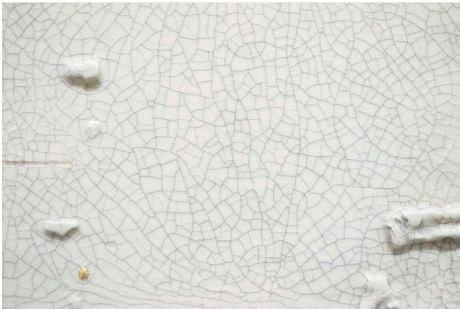
Ben Loong, Tablet 2 (detail) , 2021 © Ben Loong, images courtesy of the artist and Mizuma Gallery