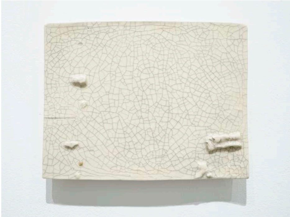
Ben Loong, Tablet 2 , 2021, glazed stoneware, gold leaf, Chinese ink, 20.7 × 26.6 × 3.5 cm