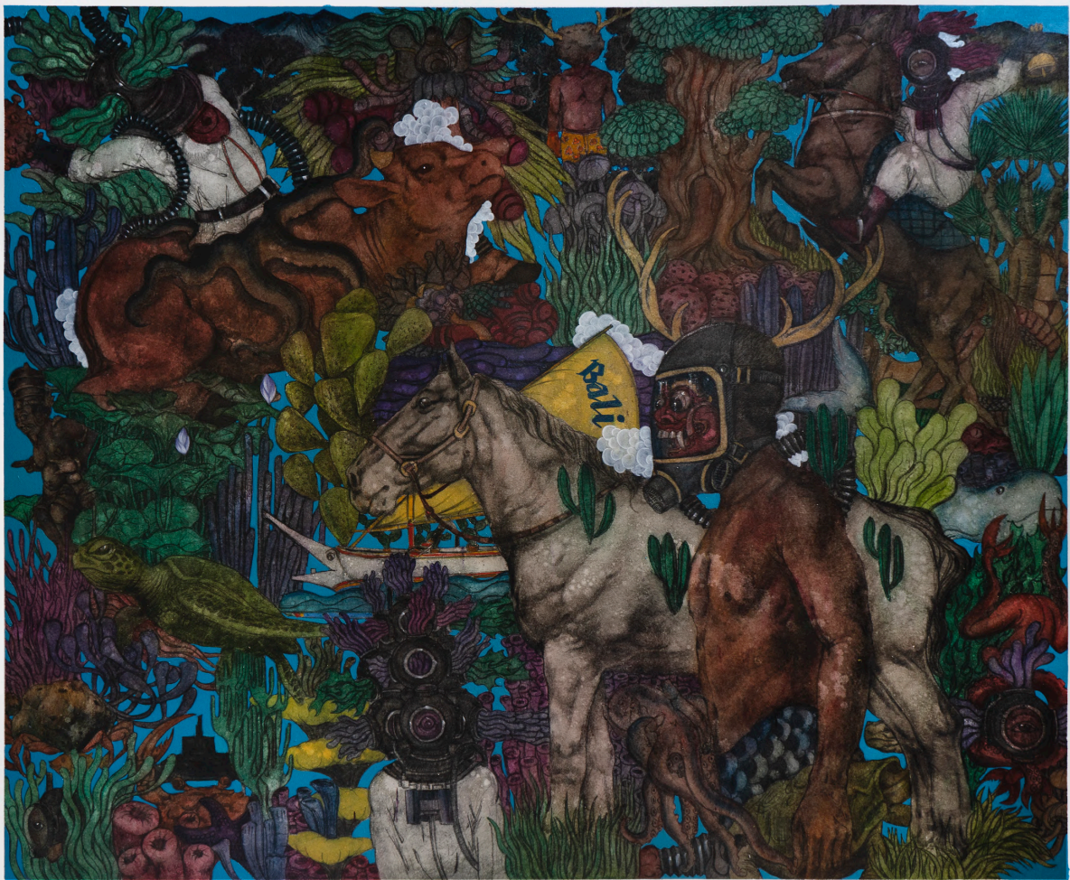
Ida Bagus Putu Purwa, Journey , 2021, charcoal and oil on canvas, 250 × 300 cm © Ida Bagus Putu Purwa courtesy of the artist and Mizuma Gallery.