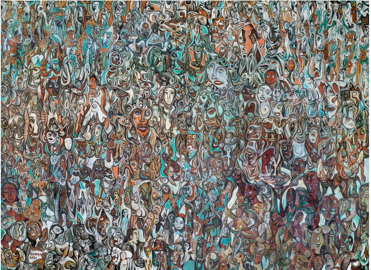
I Made Djirna, Conscience , 2021, mixed media on canvas, 280 × 380 cm © I Made Djirna, courtesy of the artist and Mizuma Gallery.