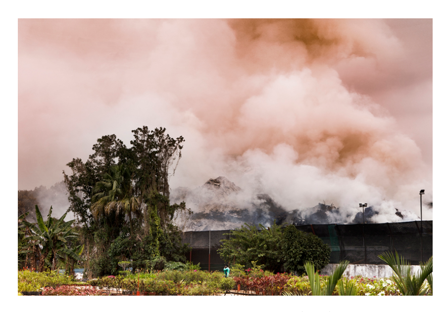
Robert Zhao Renhui, Untimely Meditations I (detail), 2022, wooden cabinet, found photographs, lightjet lightbox, LED TV, diasec, 200 \times 420 \times 50 cm © Robert Zhao Renhui, courtesy of the artist and Mizuma Gallery