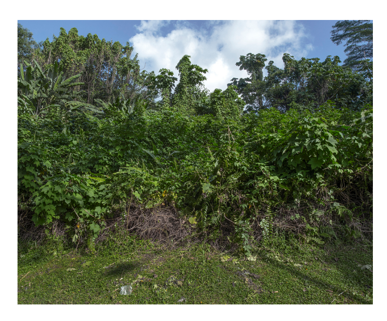
Ang Song Nian, This Garden Bears No Weed, 2022, edition 1 of 3+1 AP: UV Print on Samba Backlit and LED Lightbox, 240\times300 cm, edition 2 and 3 of 3+1 AP: print on archival inkjet, 80\times100 cm © Ang Song Nian, courtesy of the artist and Mizuma Gallery