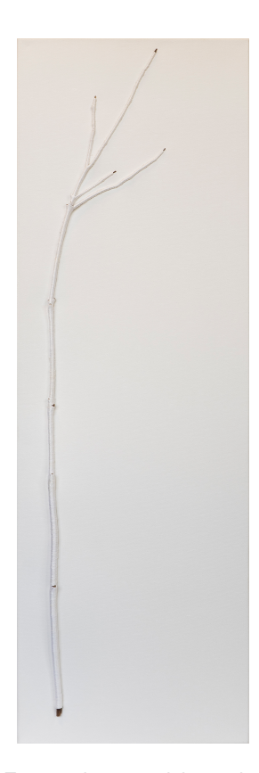
Woong Soak Teng, trying to straighten a branch #1, 2022, canvas, branch, thread, pine wood, 91.44 × 30.48 cm © Woong Soak Teng, courtesy of the artist and Mizuma Gallery