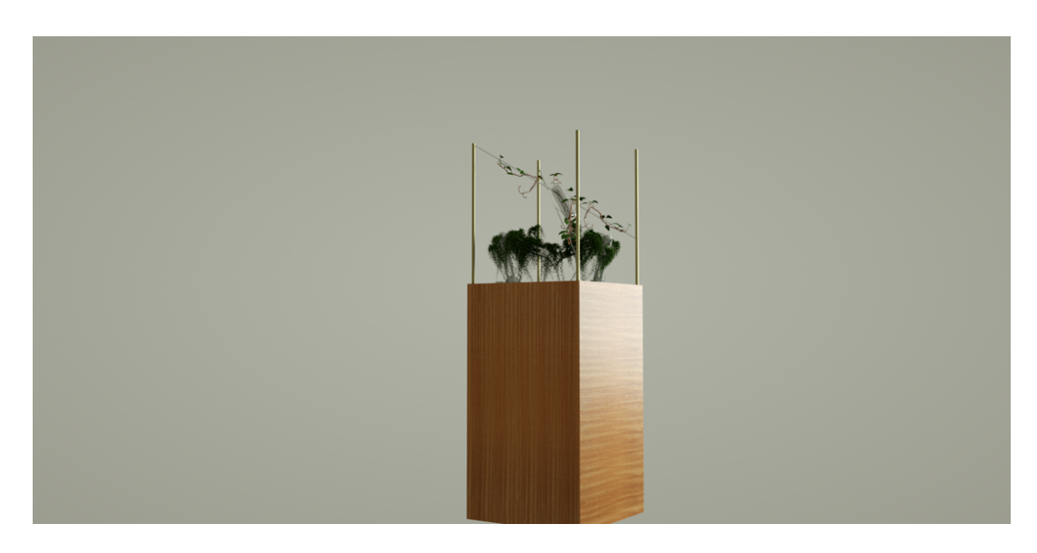
thesupersystem, Hutan jauh diulangi, hutan dekat dikendana, 2022, mixed media, 170 \times 50 \times 50 cm