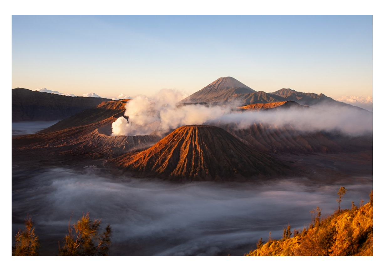
Silvana Sutanto, Sunrise over Bromo. September 2009. Bromo, East Java, Indonesia

Located in Bromo Tengger Semeru National Park, East Java, it is an active volcanic area, with more than 3,500 locals living around the area. This area is also home to about 137 species of birds, 22 species of mammals, and 4 species of reptiles in this Park.