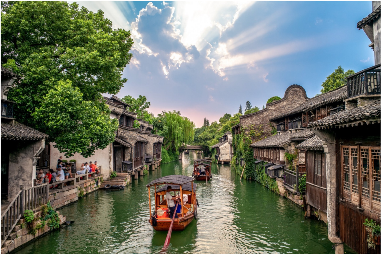
Wuzhen, a scenic historic town in Zhejiang province in Eastern China.