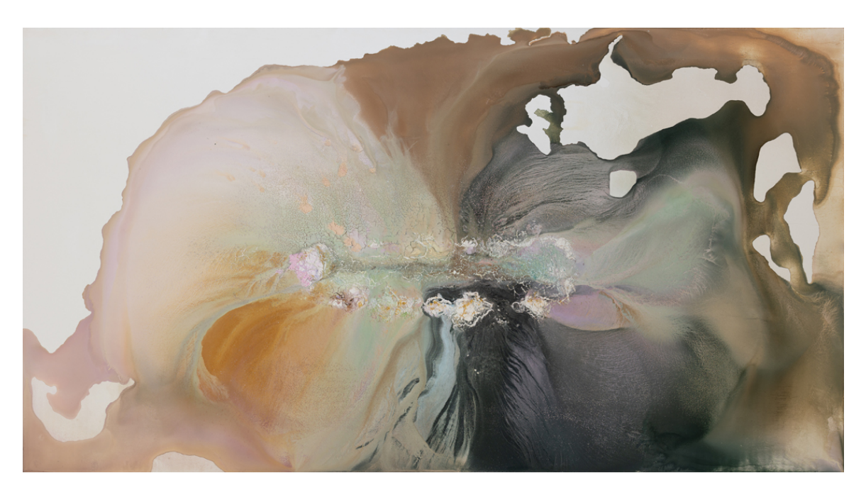
Dawn Ng, Sun's Setting and Suddenly You are in Love with Everything, 2022, acrylic paint, dye, ink on wood, 130 × 240 cm (unframed); 141 x 251 x 5.5 cm (framed)