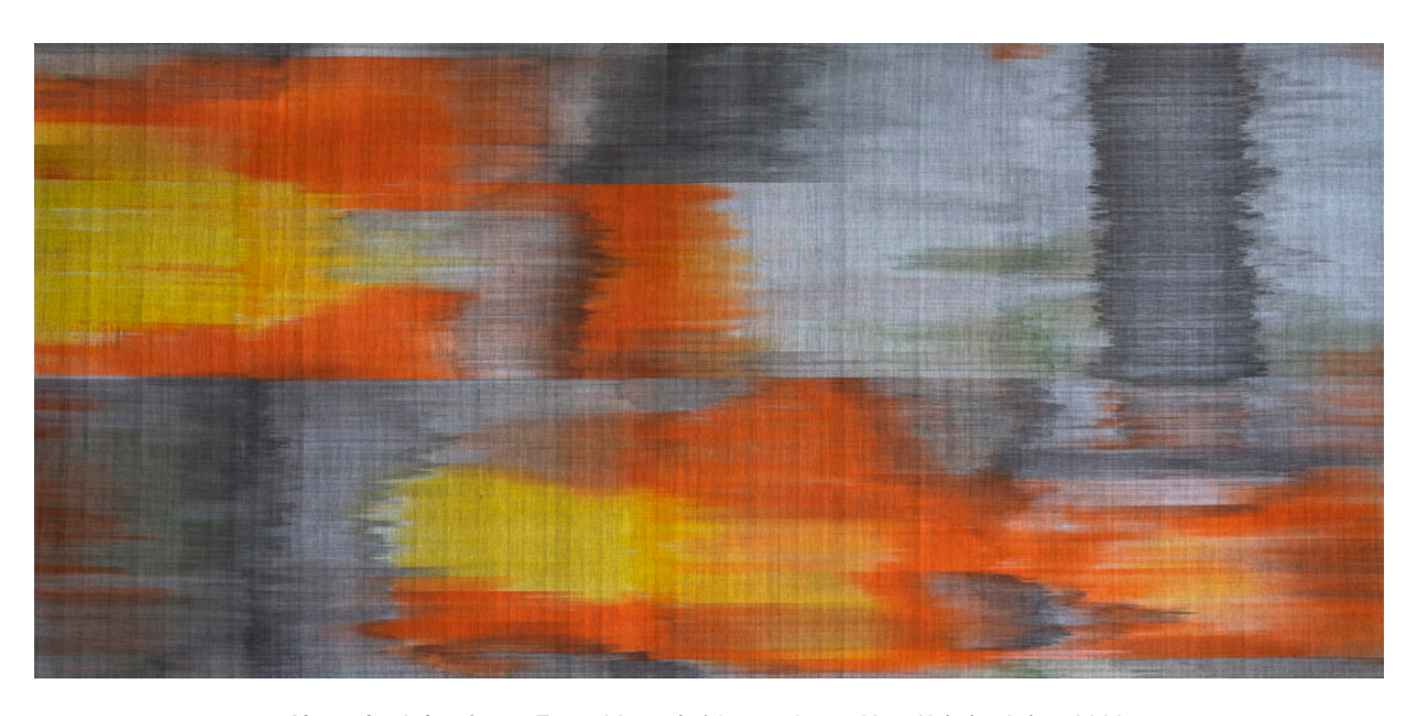
Alexander Sebastianus, Tanpa Menyadari Semua, Semua Yang Kubakar Lekas, 2022, handwoven ikat dyed cotton, framed on teak wood, 100 \times 210 \times 4.5 \text{ cm} © Alexander Sebastianus, courtesy of the artist and ISA Art Gallery