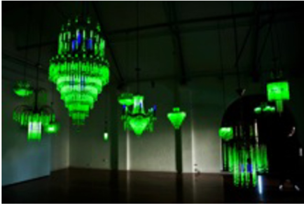
Ken + Julia Yonetani, Crystal Palace: The Great Exhibition of the Works of Industry of All Nuclear Nations (USA) (2012), 4A Centre for Contemporary Asian Art, uranium glass, metal wire, UV lights. Courtesy of the artists.

In their “uranium art,” Ken and Julia install vintage chandeliers, replacing the crystals with (mostly depleted) uranium glass beads. UV light is used to make the uranium glass glow green. The artists developed the idea of using chandeliers when they were in London, where they saw ornate chandeliers displayed in the fashion boutiques near Sloane Square. 3 Although using uranium as art material seems dangerous, uranium glass (often known as Vaseline glass) has in fact been used in art for decades, in glass decoration, jewelry, and ceramic tiles. The artists applied a Geiger counter to determine that the chandeliers emit radiation that is only slightly above normal levels (1.3 micro sievert per hour, when placed directly on the uranium glass beads). 4 They take care with all their uranium art exhibits to make sure it is not hazardous to visitors. 5