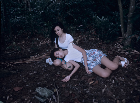
Genevieve Chua, "Full Moon and Foxes"