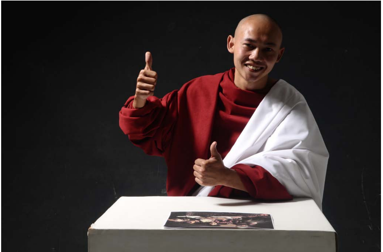
Agan Harahap, Supper at Emmaus , 2020, digital C-print on photo paper, 33 x 50 cm, edition of 3 + 1AP © Agan Harahap, image courtesy of the artist and Mizuma Gallery