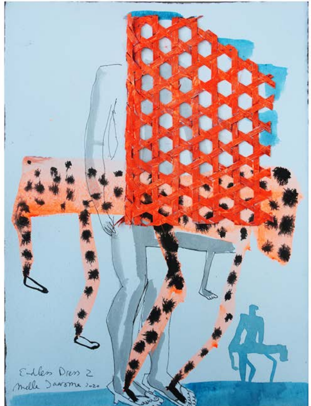
Mella Jaarsma, Endless Dress 1 and 2 , 2020, gouache and mixed media on paper, 37 x 28 cm each © Mella Jaarsma, images courtesy of the artist and Mizuma Gallery