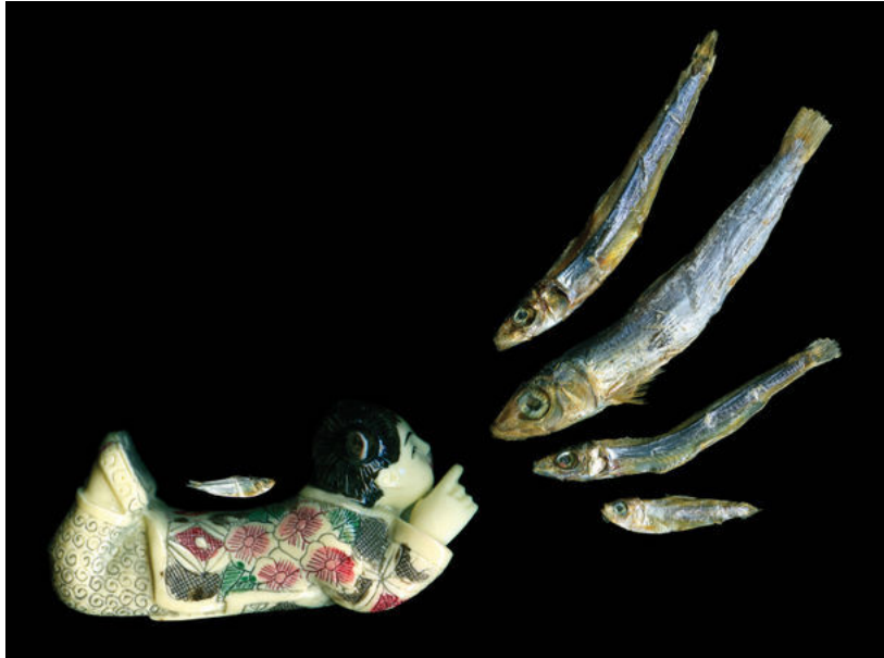
Be Nice! (2012) by Angki Purbandono

Angki's body of work doesn't only encompass noodles and superhero figurines. He has also used the common cooking ingredient anchovies, as seen in his 2012 piece entitled Be Nice! In this image, a toy in the shape of a woman appears to be scolding the four small fish.