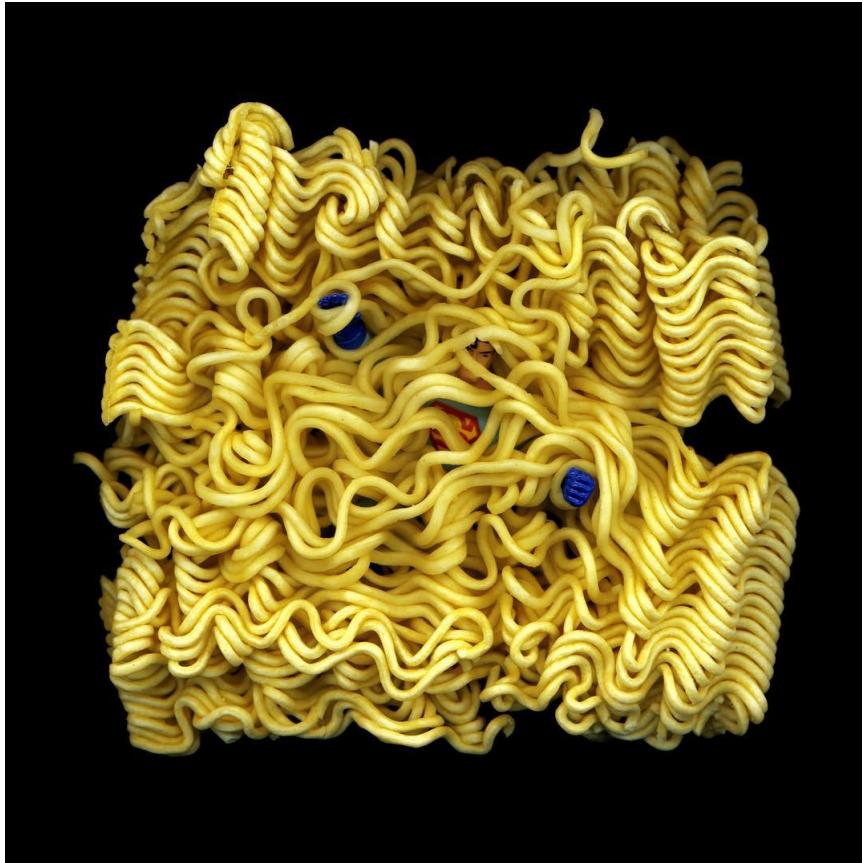
Superman Is Dead (2010) by Angki Purbandono Image credit: @angki_pu

Batman and The Noodles will be among the many pieces of artwork featured in this year's online version of Art Jakarta (19th October-15th December 2020), an annual art fair normally held at the Jakarta Convention Center.