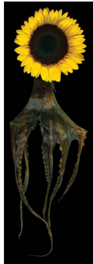
Octopus (2012) by Angki Purbandono

As Angki Purbandono proves, artists can use many everyday objects to create something that people can reflect on. With the help of technology -- including common electronic devices such as scanners -- they can materialize their unique ideas. Through noodle art, a clear message can still be conveyed to art enthusiasts.