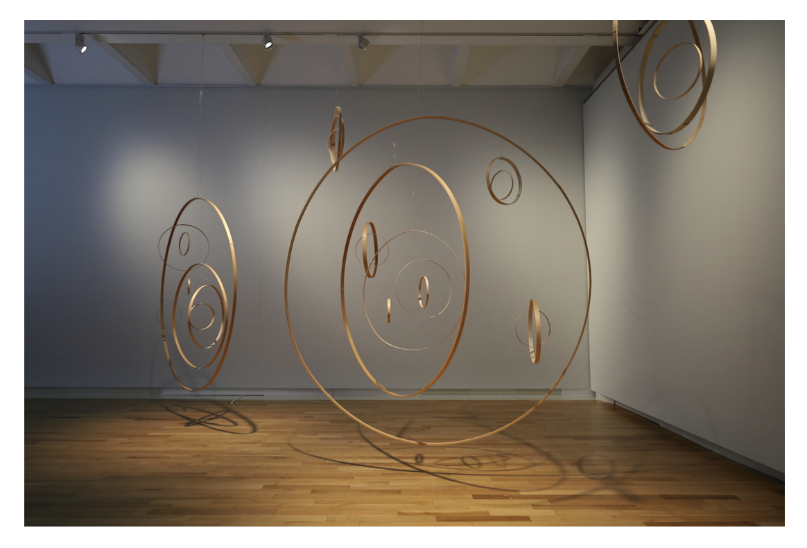
Nelo Akamatsu , Chiji-ki , 2013, installation, wood, copper wires, controllers, PC; dimensions variable © Nelo Akamatsu. Photography by Nelo Akamatsu, courtesy of the artist and Mizuma Gallery.