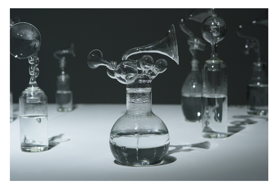
Nelo Akamatsu , Chozumaki , 2017, sound installation, water, glass vessels, magnets, plastic, electronic devices, controllers; dimensions variable © Nelo Akamatsu. Photography by Nelo Akamatsu, courtesy of the artist and Mizuma Gallery.