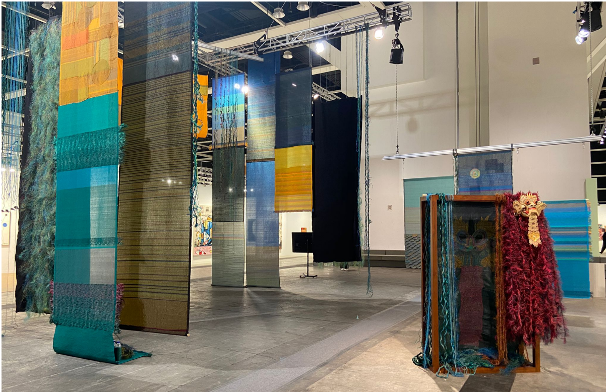
Installation view of Weaving the Ocean at Art Basel Hong Kong Encounters, 2026.

Art Basel Hong Kong 2026: Encounters EN5 27 – 29 March 2026