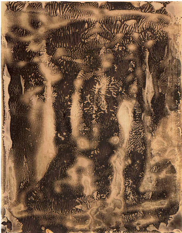
Iswanto Soerjanto , Purnama (dan) Tilem Untitled #29 , 2025, chemigram on silver gelatin paper, 35.5 × 27.8 cm