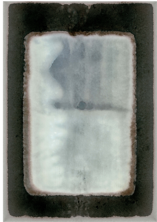
Liu Liling , Soft Rain , 2024, inkjet print, 87.3 × 61.2 cm © Liu Liling. Image courtesy of Liu Liling and Mizuma Gallery.